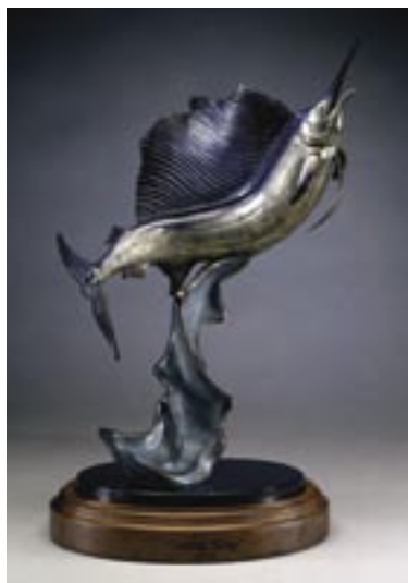
Kim Shaklee - F/ASMA Sailing Along - Atlantic Sailfish

bronze – edition of 30 15”h X 7”w X 14”l