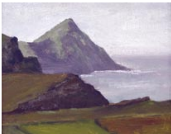
Scott Bakran, ASMA View of Puffin Island from Valentia Island