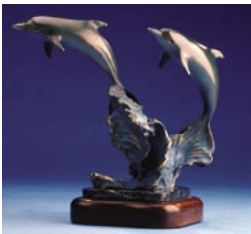
Cathy Ferrell, ASMA Rejoice II bronze 9" x 9" x 8"