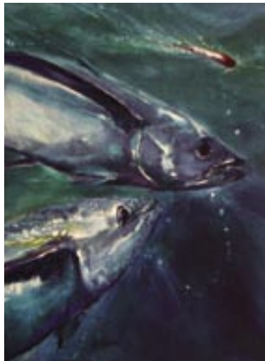
Kim Weiland, ASMA Cedar Plug