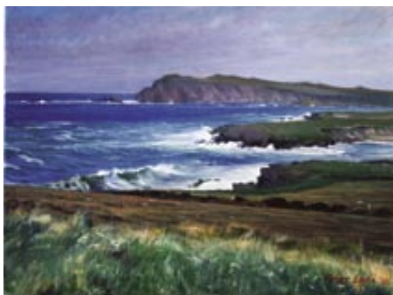
Peter E. Egeli, F/ASMA Sentinels oil on canvas 12" x 16"