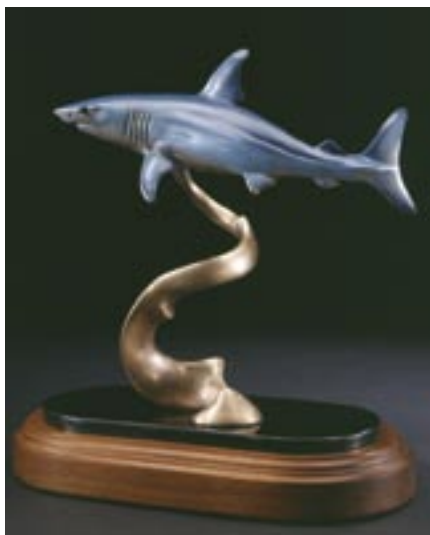
Kim Shaklee - F/ASMA Dark Shadows – Mako Shark

bronze – edition of 30 15”h X 7”w X 14”l