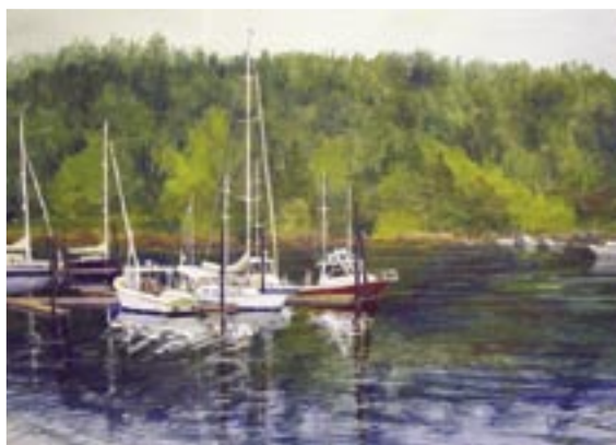
Pauline D. Lorfano Quiet, Hear the Loon acrylic 14.5" x 18"